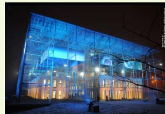
May 27, 2011 Galaxia Business Park, Transinne-Redu